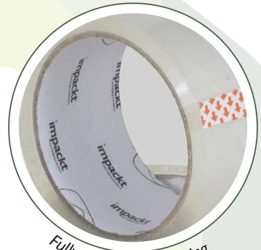
Fully Customized Printing